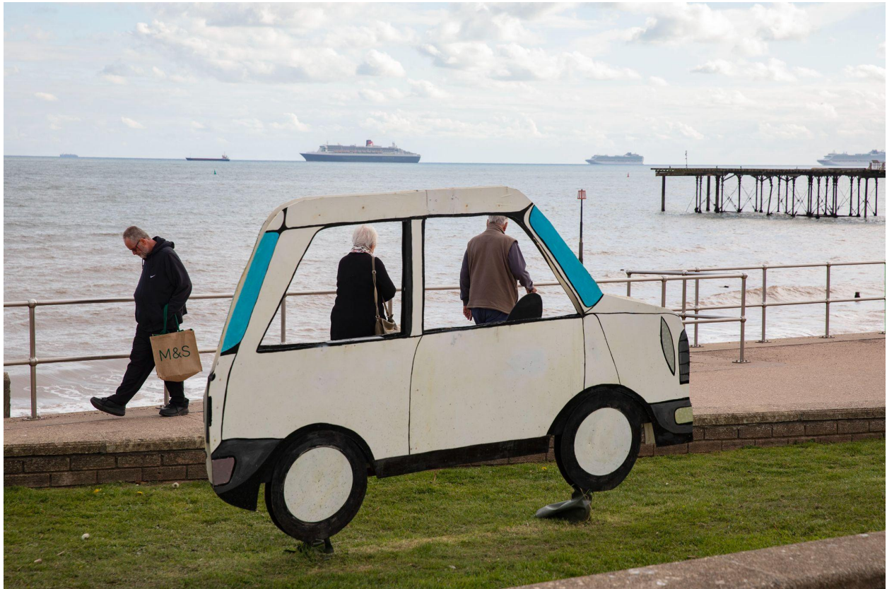
Martin Parr, "Teignmouth, Devon, England", 2020.

This year's Master of Photography is the legendary British photographer Martin Parr , who presents an exhibition of new images taken in the UK, continuing a project that he has been working on for the past half century. 'Martin Parr. Recent Works' includes images that have not been shown before alongside the installation "Beach Therapy" and a dozen photo deckchairs.