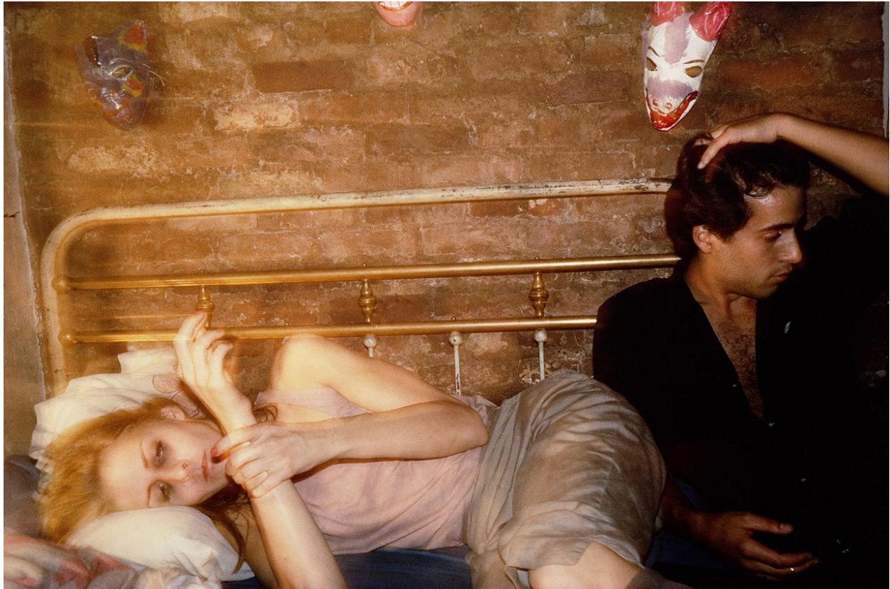
Nan Goldin, "Greer and Robert in bed, NYC", 1982 C-print. Courtesy the artist and Galerie Sophie Scheidecker.

First-time exhibitor Blue Lotus Gallery presents debut exhibition of two important photographers in the UK: works from the 1950s by the Hong Kong master photographer Fan Ho alongside black-and-white prints by the Japanese up-and-coming talent Yasuhiro Ogawa ; while Zen Foto Gallery, also showing for the first time, exhibits Seiji Kurata's seminal "Flash Up" series which depicted Tokyo's nightlife in all its diversity between 1975 and 1978. Meanwhile The Li Yuan-Chia Foundation will exhibit works by Li Yuan-Chia , whose work fused 20th century Western abstract art with Chinese tradition and lived in China, Taiwan, Italy and Britain.