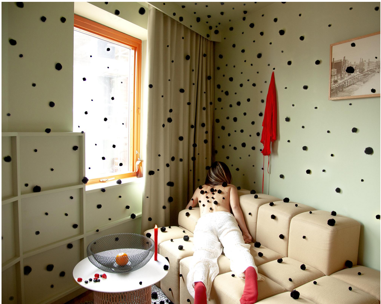
Fion Hung-Ching Yan, "Attracting Mosquitoes to Drink His Blood", 2022.